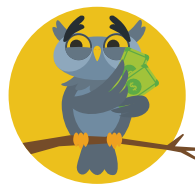
THE WARY OWL