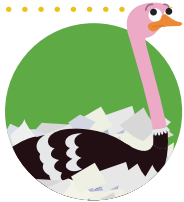
THE AVOIDING OSTRICH

Directions: Use this sheet to keep track of what you learn about money personas during your discussion and the presentation.