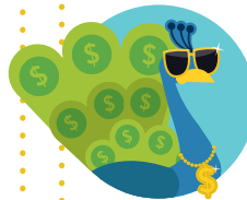
THE STRUTTIN' PEACOCK